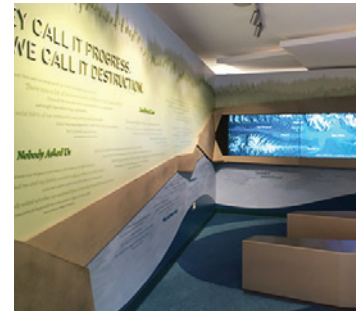
The Our Story, Our Voice gallery at W.A.C. Bennett Dam Visitor Centre