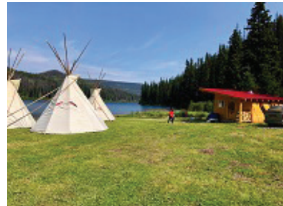
Saulteau First Nations culture camp

Articles 3, 8, 11, 12, 13, 14, 15, 16 and 24