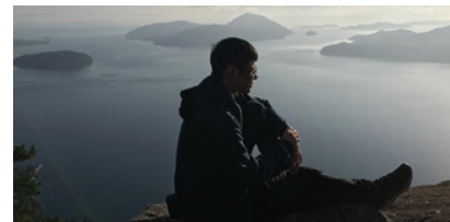
Xaxli'p student and BC Hydro scholarship recipient completes computing science degree