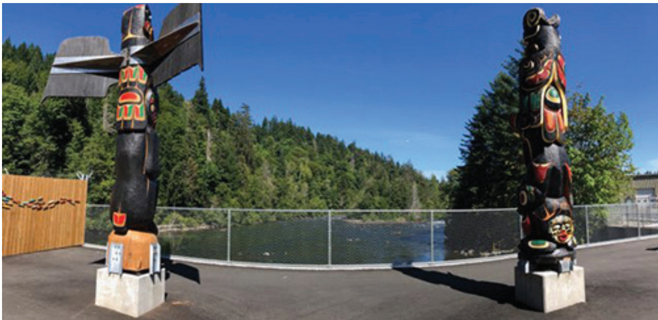
Two totems were installed at the John Hart generating station to mark our relationship progress with We Wai Kai and Wei Wai Kum

The remaining sections of this plan outline how these five themes relate to the UN Declaration (and include references to the articles in the UN Declaration which we have drawn from), set out BC Hydro's focus areas within each theme, and identify the actions BC Hydro is taking in collaboration with First Nations and Indigenous peoples.