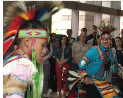
Indigenous dancers at BC Hydro's National Indigenous Peoples Day celebrations

Articles 4, 18, 19, 32, 33, 34, 35 and 40